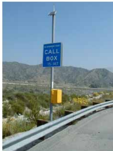
Site Type F – installed behind a guard rail.