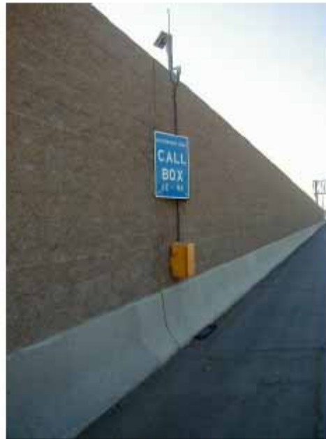
Site Type D – mounted on a soundwall.