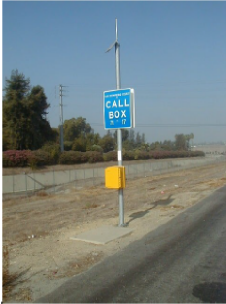
Site Type A – installed at-grade, in soil.