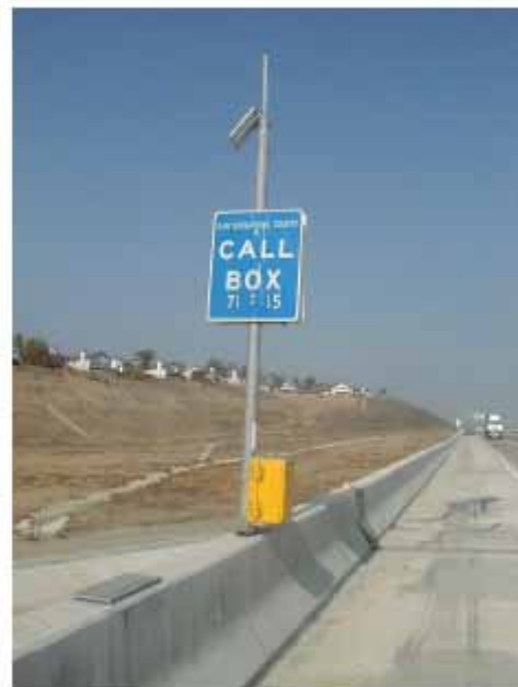
Site Type H or K – installed on a k-rail or concrete barrier.