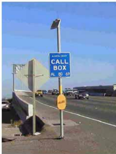
Site Type G – installed at-grade, in concrete.