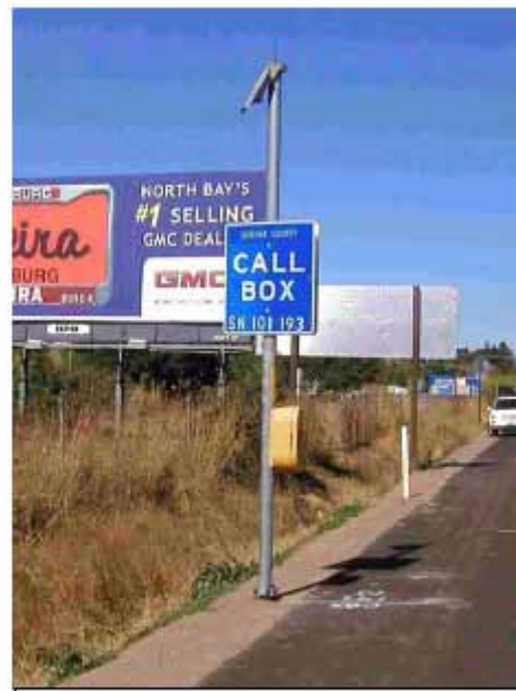
Site Type M – same as a Site Type F, except no guard rail.