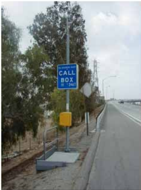
Site Type C – installed on an in-fill slope.