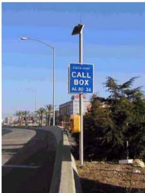
Site Type E – installed behind a k-rail or concrete barrier