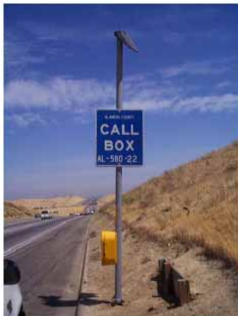
Site Type L – installed behind a curb.