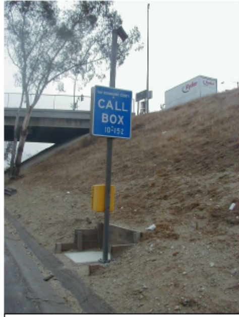
Site Type B – installed in a cut-slope.